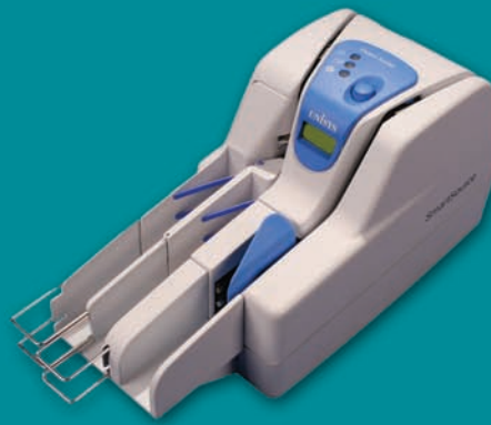
Branch Capture Scanner

Due to limited seating, please fax reservations by March 4, 2009 to: