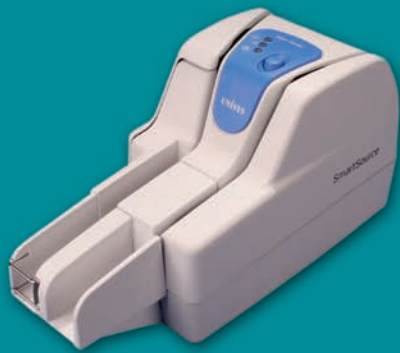
Merchant Capture Scanner