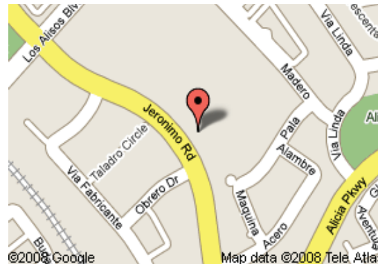
25725 Jeronimo Road, Mission Viejo CA 92691

Plan your next phase in Image Exchange by integrating Image Exchange, Teller Capture and Cash Automation.